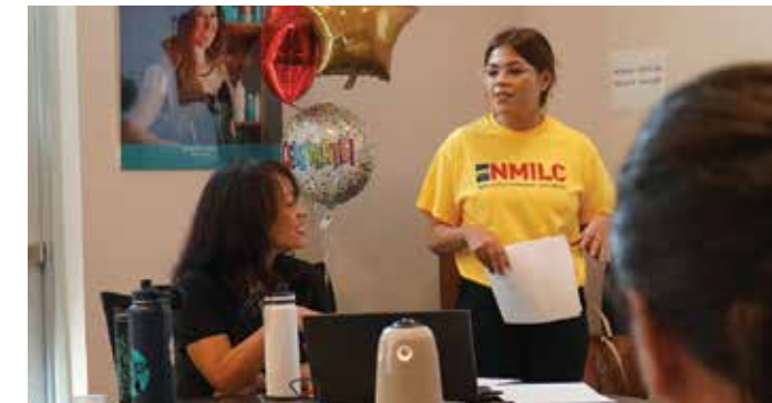
Our Economic Justice & Policy Legal Assistant presenting at the Color Theory Pre-Launch Training at the WESST Enterprise Center.