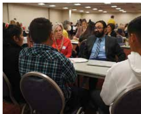
During our Special Immigrant Juvenile Status CLE and Legal Clinic in October 2022, 35 pro bono attorneys provided services to SIJS clients.

Legal and medical pro bonos , court-certified interpreters, and volunteers greatly increase our team's capacity to serve our low-income immigrant and refugee communities. In 2022, 227 pro bono professionals and volunteers assisted immigrant community members who were unable to afford legal services.